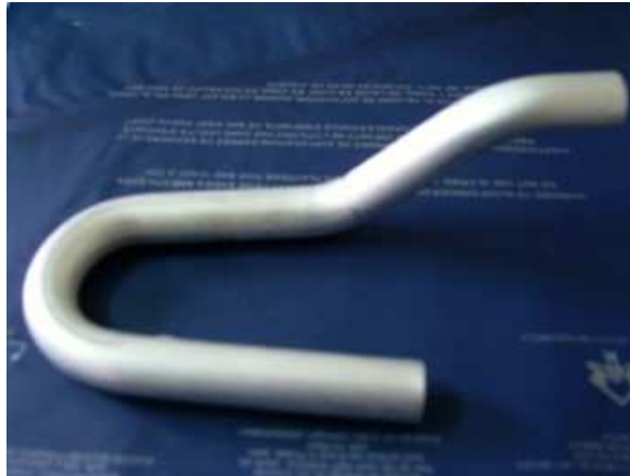
Fig. 3. Appearance of the new bending process