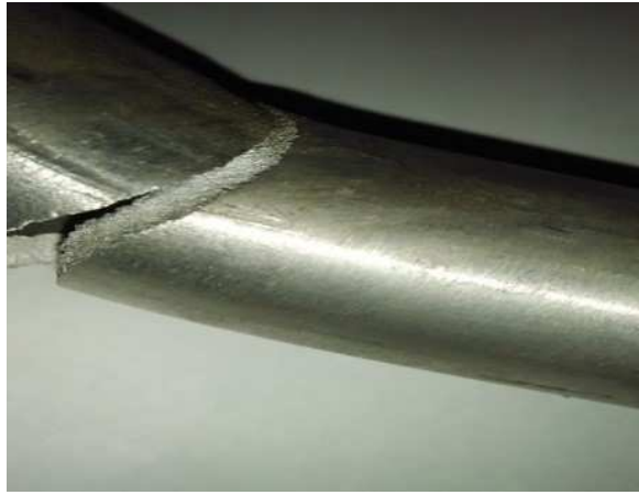
Fig. 2. Appearance of the traditional bending process

bend-shaping process is an ideal processing method for the plastic forming of 6065 aluminum bending profiles.